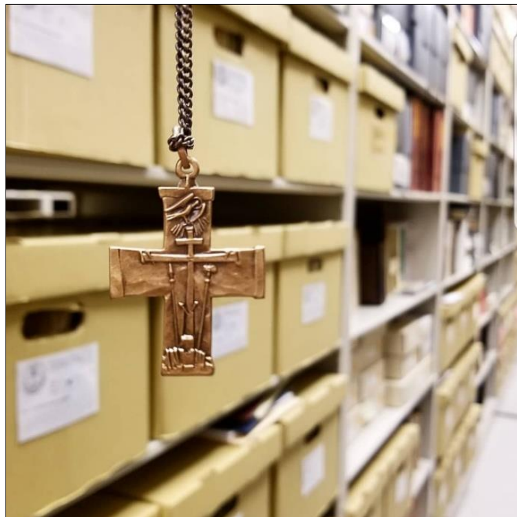
Above: CSsR Cross in Redemptorist Archives.

At this archive, not only are we engaged with researchers from around the globe, we produce scholarship as well. In addition to regular research queries, our online Redemptorist North American Historical Bulletin is an open-source publication ( https://www.redemptorists.com/historical-institute/the-redemptorist-north-american-historical-bulletin/ ). The latest edition is a special issue devoted to Redemptorists and the influenza epidemic of 1918.