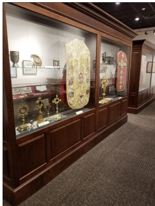
Above: Redemptorist Archives exhibit room.

Prior to their transfer to Philadelphia, the materials were divided between separate repositories for the two main American provinces – the Baltimore and Denver Provinces, which cover the Eastern and Western regions of the United States. By consolidating the archives under one roof, the Redemptorists were able to house the materials in state-of-the-art facilities and improve records management across the provinces.