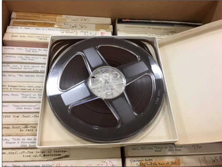
Above: Open-Reel Audiotape from Special Collections & Archives, Wake Forest University

repository for Baptist records in the state of North Carolina, although no longer affiliated with the BSCNC, and maintains the historic records of the Baptist State Convention, among other Baptist collections.