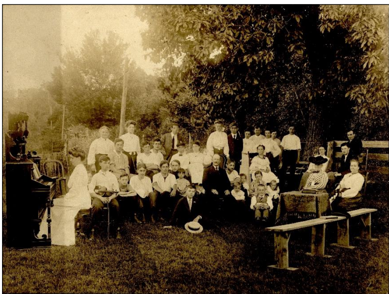
Above: Camp Meeting at Camp Wofowag, near Moodus, CT

This exhibit also worked cooperatively to create oral history interviews from several people connected to the Holiness camp meetings, and their interviews are included in the exhibit, as well as examples of camp meeting music played on an historic collapsible organ from the period. Also working with Asbury Theological Seminary's First Fruits Press, several historic volumes on the camp meeting were republished for those interested in further research on the subject. While the historic period of the Methodist and Holiness camp meeting is fading, others are beginning to recognize its historical importance and significance in the understanding of religious movements in the United States.