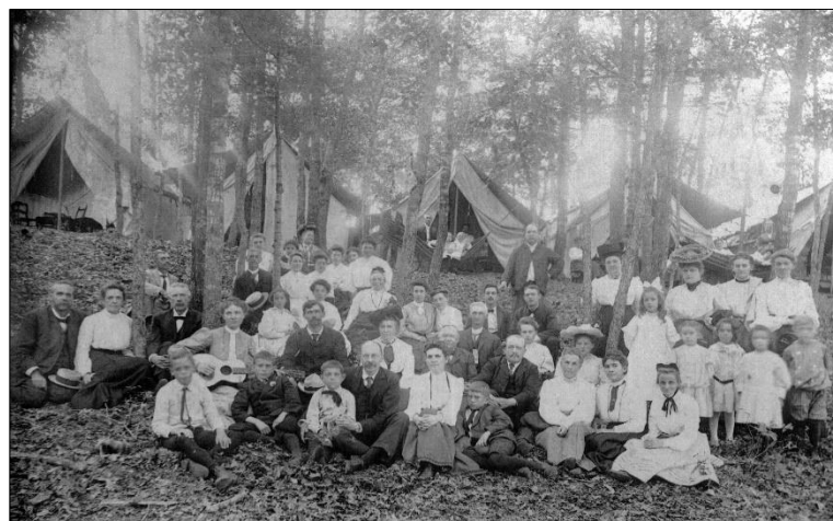
Above: Unknown Camp Meeting with Tents

As the religious fervor was fading, the Holiness Movement adopted the format in 1866 to form the National Camp Meeting Association for the Promotion of Holiness. Their second national camp meeting in Manheim, Pennsylvania gathered an estimated 25,000 people in attendance. The social difference was obvious, as now the camp meeting was encouraging urban Christians to temporarily leave the cities for a revival in the woods, as opposed to the earlier Methodist camp meetings, which brought rural people together into temporary “towns.”