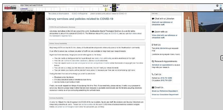
Above: Capture of SEBTS webpage regarding library services and policies.

To serve the institution well, it quickly became clear that we needed to preserve the story of how SEBTS responded to this crisis. Toward this end, our department preserved institutional emails relating to Seminary policy. The Archivist also utilized the Internet Archive's "Wayback Machine" to preserve institutional websites related to COVID-19. This free tool, while requiring considerable manual data entry, allowed the Archives to preserve vital material. The Archivist entered the addresses of pertinent websites into the "Save Page Now" feature of the Wayback Machine twice per week (on Tuesdays and Fridays).